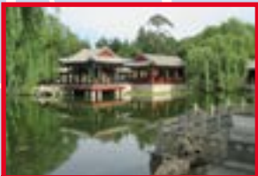
SUMMER PALACE – 3.5km FROM PKU